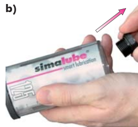
b) Remove gas generator with a socket wrench (SW21 mm)