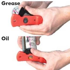
Cut off plug