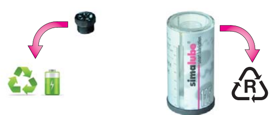
Dispose of intact gas generator in battery recycling and empty housing in plastic recycling.

(Warning: dispose of leftover grease separately)