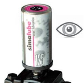
regularly check simalube