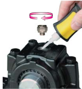
Screw in reducing nipple (if necessary, seal lubrication point)