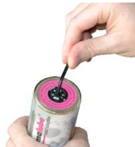
Activate dispensing time with 3 mm Allen key