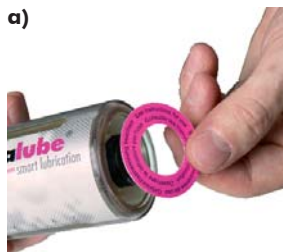
a) Remove cover disk