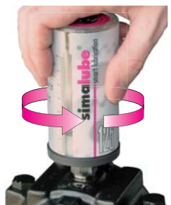
Either refill or dispose of empty lubricators