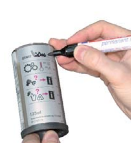
Write in activation date