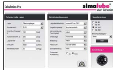
Use "Calculation Pro" to choose correct lubricant, dispensing time, and lubricator size.

("Calculation Pro" is available at www.simatec.com , in the App Store, and in the Android Market.)