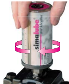
screw in lubricator