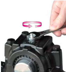
Remove connector nipple