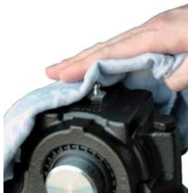
Clean lubrication point