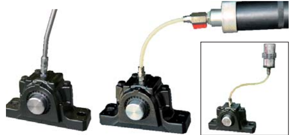
Lubricate the grease lines with a grease gun (fill tubes completely)